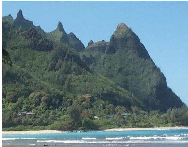
Ke'e Beach on the North Shore

Our guests are entitled to substantial discount at one of the most magnificent golf courses in the world. What a deal!