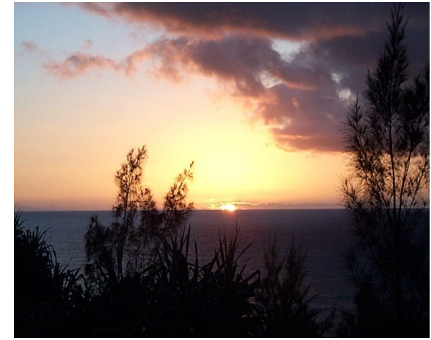
Ocean Sunset from The Cliffs at Princeville